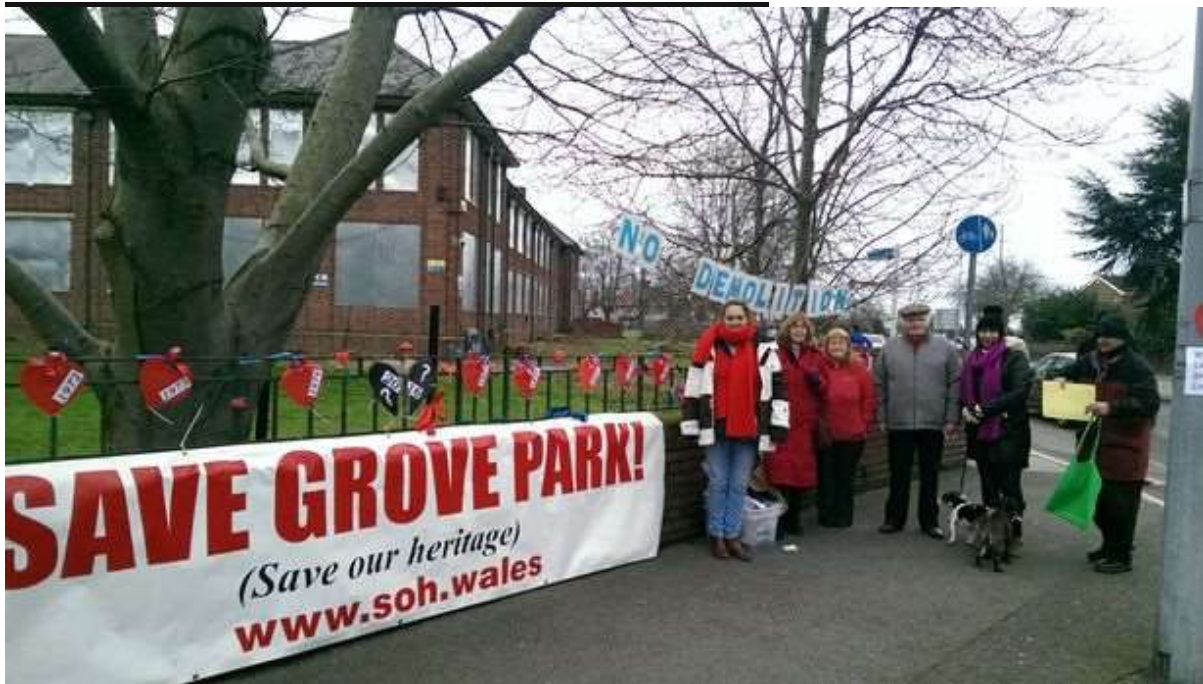
Campaigners against the demolition of the former Grove Park School in Wrexham