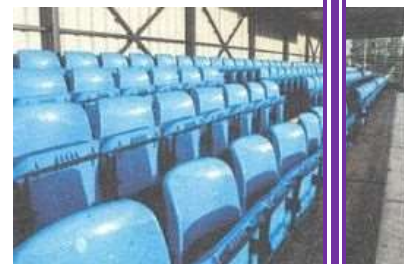
'Grandstand' view on cards for Anglesey football fans if stadium seating plan agreed