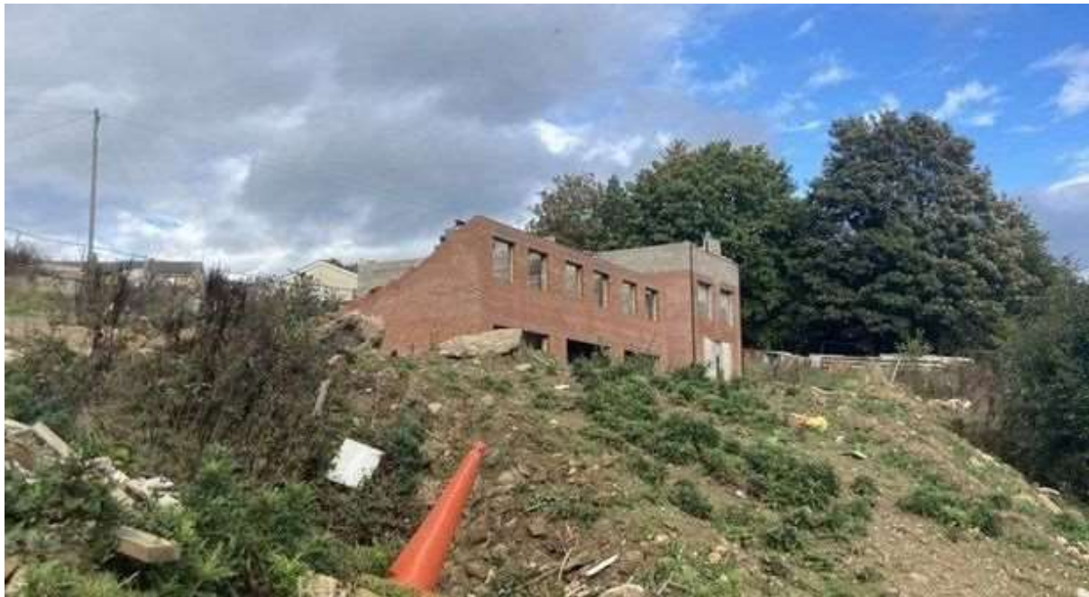
Land for sale in School Lane, Southsea, Wrexham