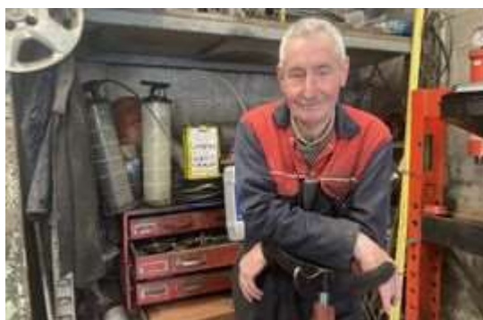
School told it can 'no longer run an after school club' by Conwy Council