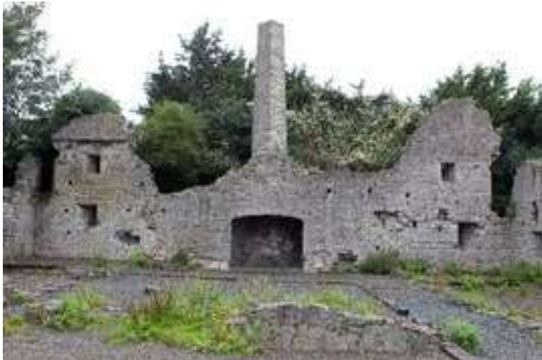
The ruined medieval North Wales manor house with a link to an English civil war

A bid by healthcare company Apollo to turn the school into a medical training facility failed to materialise because of coronavirus travel restrictions at the time, according to the LDR Service. Previous plans to create a new site as part of the Coleg Cambria campuses also fell through.