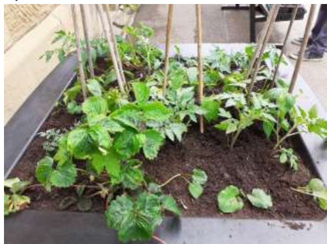
Vegetables in the centre planter at Ruabon Station