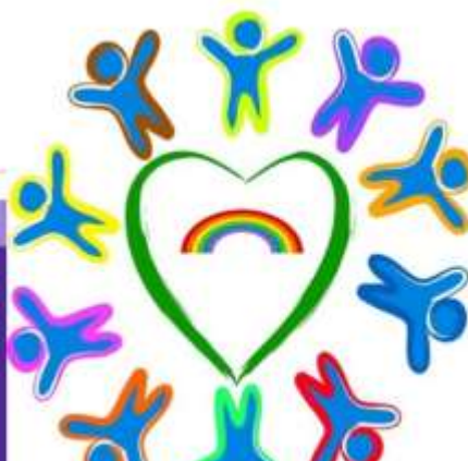
Feel Good bags